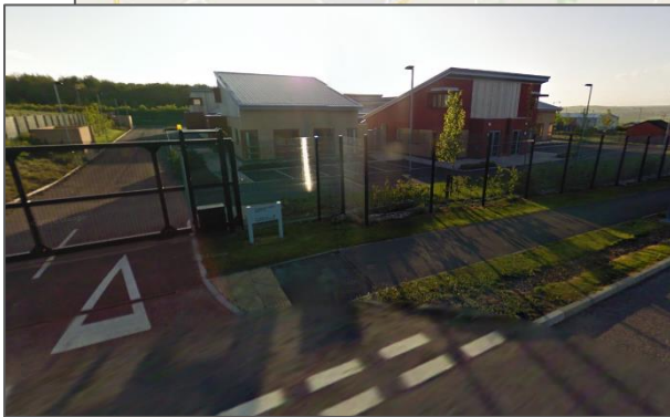
RAB Consultants, Unit 13

Second Floor, Cathedral House, Beacon Street, Lichfield WS13 7AA T. 01543 547 303